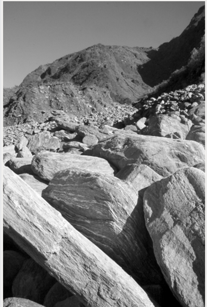
Spectacular scenery like this rock fall I shot at the side of the Fox Glacier is just one of the things luring me across the Tasman.

So you can rest assured that I'll still be offering you the same comprehensive range of writing services, albeit from a lot further away.